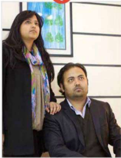
Ar. Ankita & Pratyosh Studio An-V-Thot Architects

TEXT BY: Panna Roy Choudhury